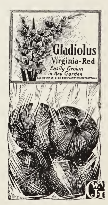
Cellophane Bag of Gladiolus